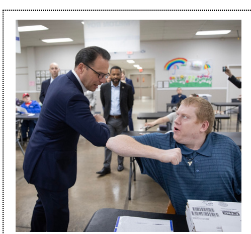
Pa. Governor Josh Shapiro greets supported individuals in Warminster, PA.

"A budget I think is more than just a set of numbers on a spreadsheet - it's a statement of